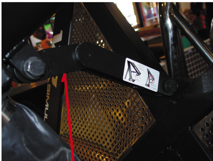
This is NG. (Short part of Safety link come to Actuator side then joint part is hitting to actuator.)